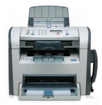
HP LaserJet M1319 MFP

Businesses that need high-quality laser printing and fax, print, copy and scan functions in one fast, affordable, multifunction laser device.