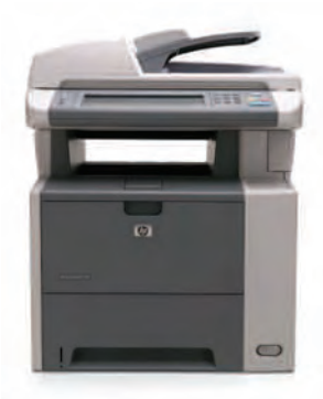
HP LaserJet M3027 MFP series M3027/M3027x

Finishing: 125-sheet output bin, automatic two-sided printing and copying