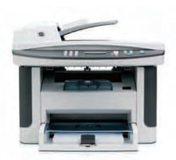
HP LaserJet M1522 MFP series 1522n/1522nf

Finishing: 100-sheet facedown output bin