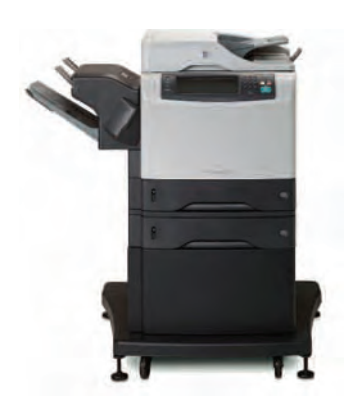
HP LaserJet M4345 MFP series M4345/M4345x/M4345xs

Finally, most MFP devices are also network-capable (with an optional HP Jetdirect print server), so they can accommodate your changing business needs. In other words, as your business grows, your HP MFP device grows right along with it.