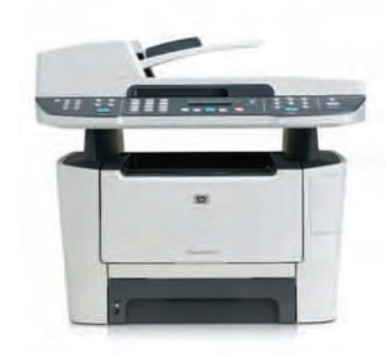
HP LaserJet M2727nf MFP

Finishing: 125-sheet facedown output bin