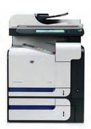
HP Color LaserJet CM3530 MFP series CM3530

Finishing: Automatic two-sided printing and copying, stapler/stacker accessory